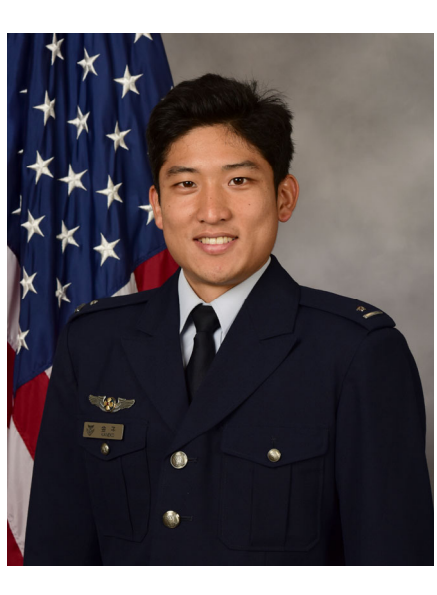
Ibaraki, Japan T-38C Talon